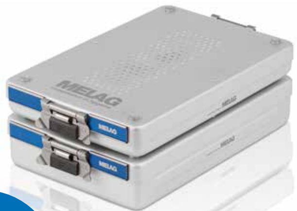
MELAstore – Boxes