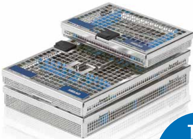
MELAstore – Trays

Safe instrument storage in the MELAstore system raises the level of protection afforded to the practice team and the instruments themselves.